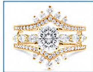
C† WITH ENGAGEMENT RING