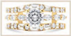
D! WITH ENGAGEMENT RING