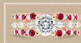
G† WITH ENGAGEMENT RING