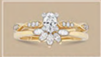
A† WITH ENGAGEMENT RING