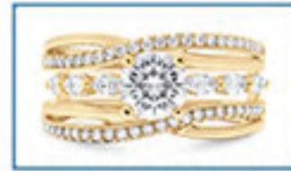
C† WITH ENGAGEMENT RING