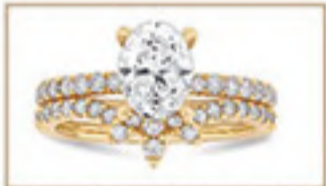
D1 WITH ENGAGEMENT RING