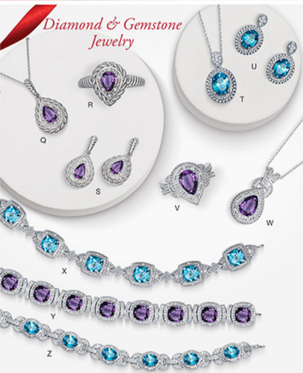
Diamond & Gemstone Jewelry

Whether you're looking to surprise a loved one or treat yourself, the versatility and beauty of silver jewelry make it a perfect choice.