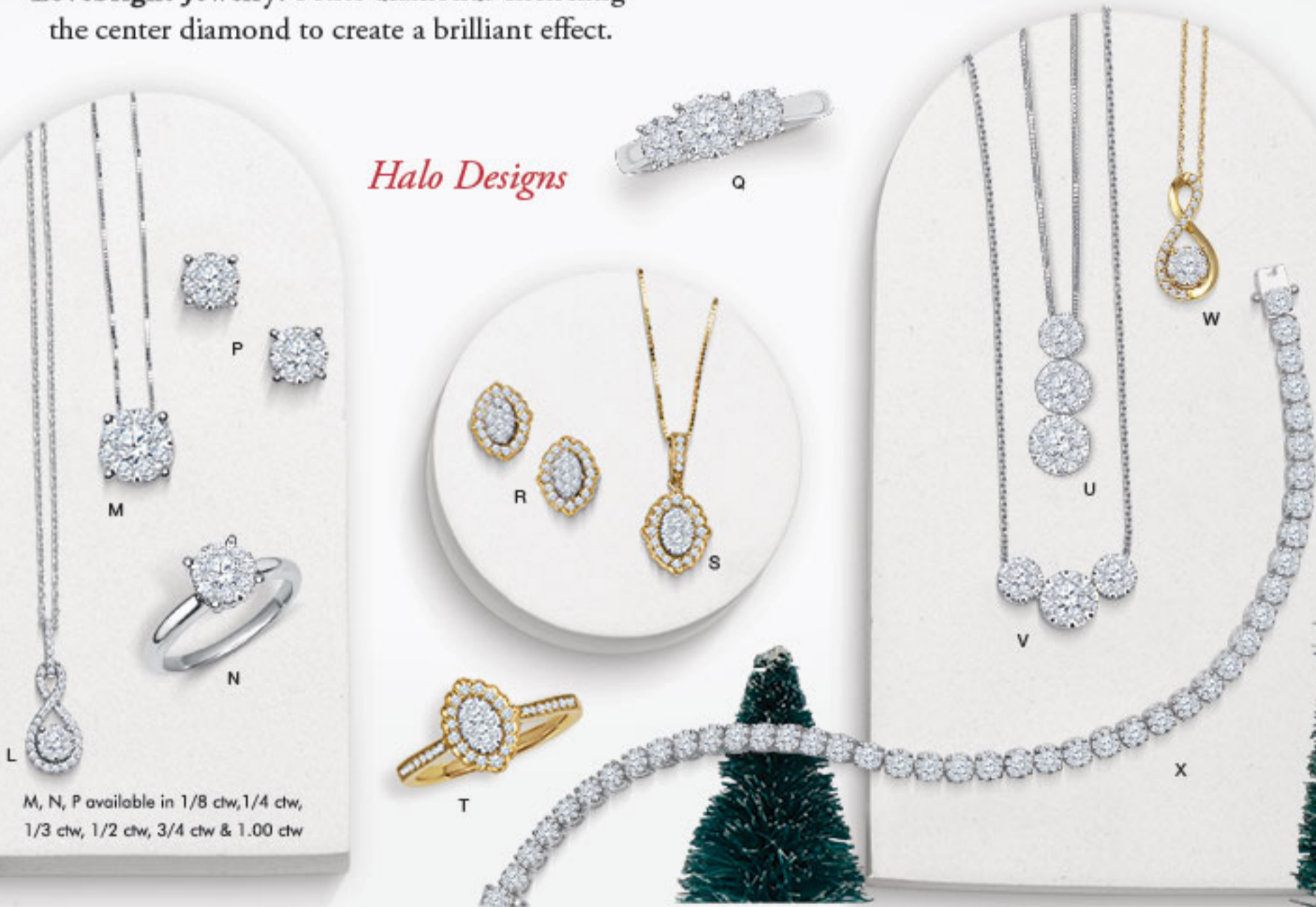
A. 1/2 carat tw scatter necklace B. 1/5 carat tw scatter necklace C. 1/4 carat tw scatter earrings D. 1 carat tw mixed shape diamond pendant E. 1/2 carat tw scatter necklace F. 1/5 carat tw scatter ring G. 1/6 carat tw curb link ring H. 1/3 carat tw curb link hoop earrings J. 1/3 carat tw curb link pendant K. 1 carat tw curb link bracelet L. 1/4 carat tw pendant M. Halo pendant 1/4 carat tw, 1/2 carat tw, 3/4 carat tw, 1 carat tw N. Halo ring 1/4 carat tw, 1/2 carat tw, 3/4 carat tw, 1 carat tw P. Halo earrings 1/4 carat tw, 1/2 carat tw, 3/4 carat tw, 1 carat tw Q. 3 stone ring 1/3 carat tw, 1/2 carat tw, 1 carat tw R. 1/4 carat tw oval earrings S. 1/4 carat tw oval pendant T. 1/3 carat tw oval ring U. 3 stone pendant 1/4 carat tw, 1/2 carat tw, 3/4 carat tw, 1 carat tw V. 3 stone pendant 1/3 carat tw, 1/2 carat tw, 3/4 carat tw, 1 carat tw W. 1/5 carat tw pendant X. Halo bracelet 3 carat tw 5 carat tw