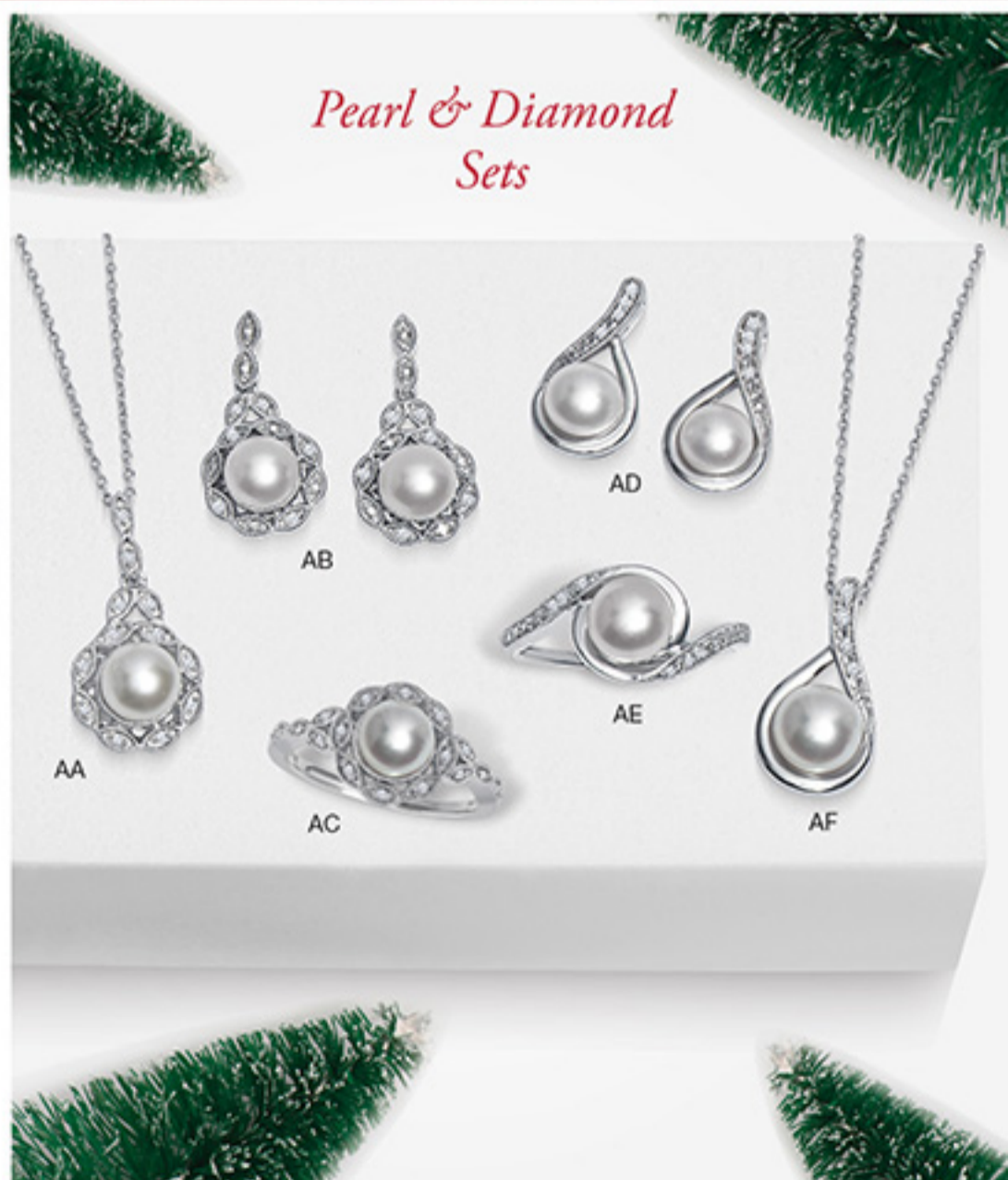
Pearl & Diamond Sets

A. Diamond rectangular medallion pendant B. Diamond cross pendant C. Diamond infinity cross pendant D. Diamond snowflake pendant E. Diamond twin heart pendant F. Diamond round medallion pendant G. Diamond heart arrow pendant H. Diamond min heart pendant J. Diamond infinity heart pendant K. Diamond angel wing pendant L. Diamond crosslariat bracelet M. Diamond bar lariat bracelet N. Diamond infinity lariat bracelet P. Diamond angel wing earrings Q. Amethyst and diamond pendant R. Amethyst and diamond ring S. Amethyst and diamond earrings T. Blue topaz and diamond pendant U. Blue topaz and diamond earrings V. Amethyst and diamond ring W. Amethyst and diamond pendant X. Blue topaz and diamond bracelet Y. Amethyst and diamond bracelet Z. Blue topaz and diamond bracelet AA. Pearl and diamond pendant AB. Pearl and diamond earrings AC. Pearl and diamond ring AD. Pearl and diamond earrings AE. Pearl and diamond ring AF. Pearl and diamond pendant