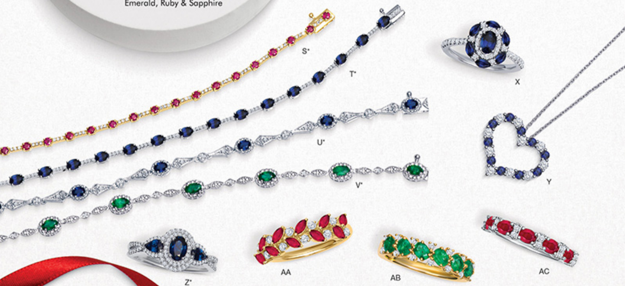
A. Ruby and diamond pendant B. Ruby and diamond ring C. Sapphire and diamond pendant D. Sapphire and diamond ring E. Emerald and diamond ring F. Emerald and diamond pendant G. Emerald and diamond earrings H. Sapphire and diamond pendant J. Sapphire and diamond earrings K. Sapphire and diamond ring L. Pearl and diamond pendant M. Pearl and diamond halo pendant N. Pearl and diamond halo ring P. Pearl and diamond pendant Q. Pearl and diamond ring R. Pearl and diamond earrings S. Ruby and diamond bracelet T. Sapphire and diamond bracelet U. Sapphire and diamond bracelet V. Emerald and diamond bracelet W. Sapphire and diamond pendant X. Sapphire and diamond ring Y. Sapphire and diamond heart pendant 1/8 carat tw, 1/4 carat tw, 1/2 carat tw Z. Sapphire and diamond ring AA. Ruby and diamond band AB. Emerald and diamond band AC. Ruby and diamond band

Gemstones are essentials in any jewelry wardrobe. Vibrant, sparkling, and full of color.