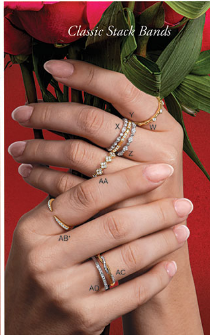
Classic Stack Bands

A. 1 1/4 carat tw halfway bezel necklace B. 1 1/4 carat tw fashion necklace C. 1/4 carat tw medallion pendant D. 1/3 carat tw diamond band E. Bezel diamond band 1/10 carat tw, 1/4 carat tw F. 1/5 carat tw fluted clover earrings G. 1/6 carat tw fluted clover ring H. 1/4 carat tw fluted clover pendant J. 1/4 carat tw fluted heart pendant K. 1/5 carat tw fluted angel wing pendant L. 1/6 carat tw fluted heart ring M. 1/5 carat tw fluted heart earrings N. 1/6 carat tw hoop earrings P. 1/6 carat tw hoop earrings Q. Bamboo huggies earrings 1/8 carat tw, 1/3 carat tw R. 1 carat tw bezel bracelet S. 1/4 carat tw diamond bracelet T. 1/10 carat tw diamond bracelet U. 1/10 carat tw diamond bracelet V. 1/4 carat tw baguette station bracelet W. Bamboo stack band 1/10 carat tw, 1/5 carat tw X. 1/10 carat tw stack band Y. 1/8 carat tw stack band Z. 1/10 carat tw stack band AA. 1/4 carat tw clover ring AB. 1/5 carat tw claw ring AC. 1/6 carat tw twisted band AD. 1/6 carat tw stack band