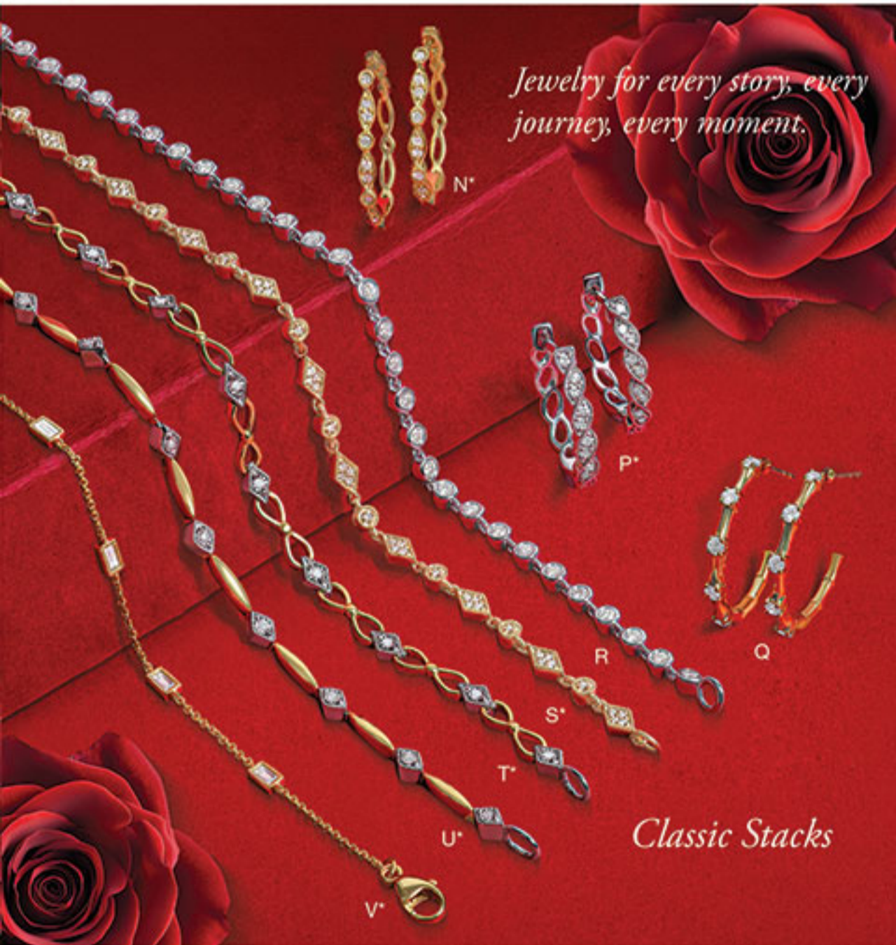
Jewelry for every story, every journey, every moment.